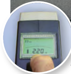
LCD meter displays signal strength, mode, depth and battery condition